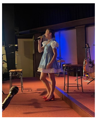
Fabulous Fakes 2022-The Barn, Dixon, MO